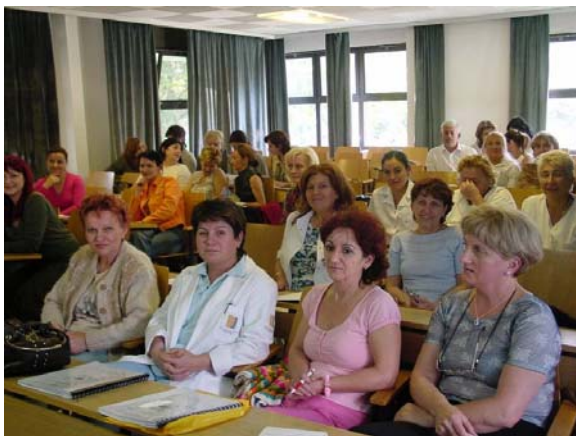
My class at the Infectious Disease Clinic