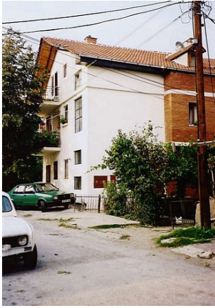
My Home In Skopje