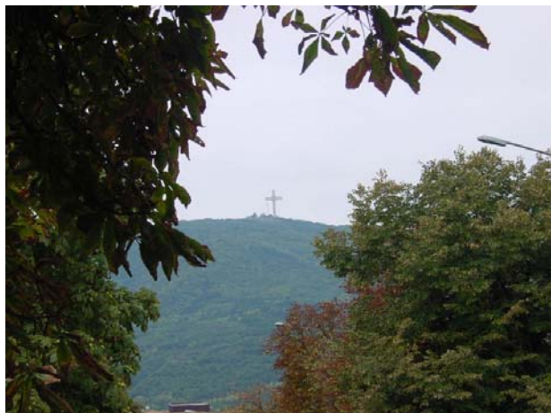
Cross on Mountain overlooking Skopje